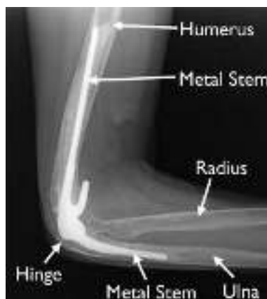
An x-ray of a total elbow replacement taken from the side.

Some surgeons will place a temporary tube in the joint to drain the surgical fluid. This tube can be easily removed in your hospital room within the first few days after surgery.